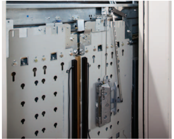
V50A door clutch mounting kit

When existing door interlocks can be retained, clutch-mounting kits are available. These kits will interface with many common door interlocks. This option retains components that are in good working condition or that may have been recently upgraded.