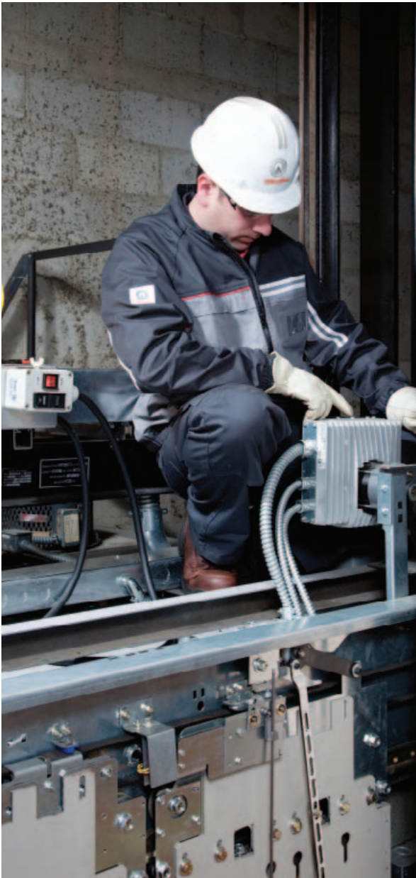
Schindler V50A door operator

Proper door operation is essential to maintaining elevator passenger satisfaction and safety. The Schindler Varidor 50A has been developed to address this key issue by delivering a wide range of advanced features to elevator door operation while enhancing passenger comfort, convenience, and safety. Benefits include the ability to: